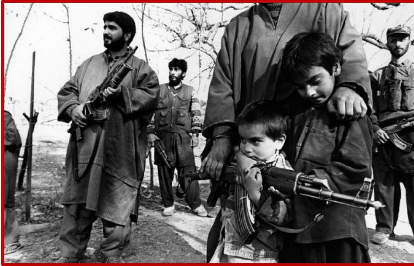
Jammu & Kashmir