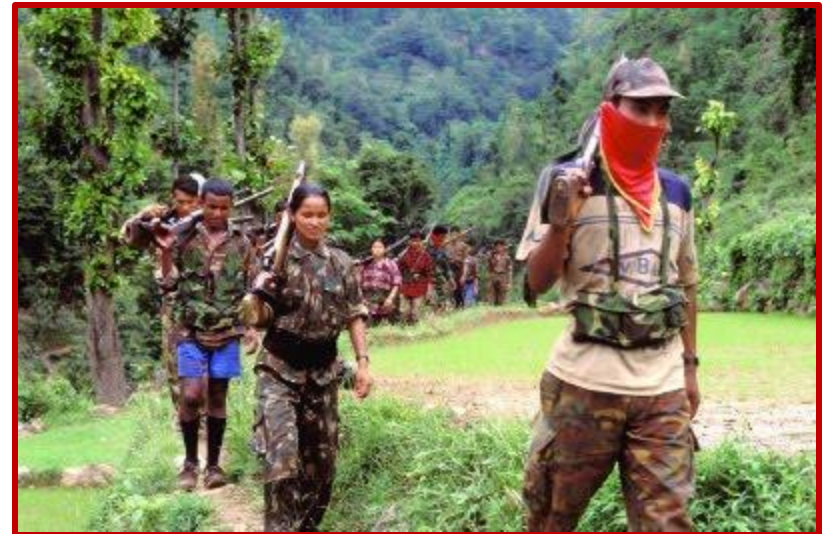
North East States